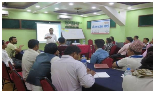
A Bible study group taking part in Sangsangai (left) and training on local government planning processes (right)

Some of our partner churches are reaching the point in the Sangsangai process where they are beginning to look at engaging and working with their local communities. We are learning in this project, that it can take time for local churches to gain the confidence to step out into the community and work together with them.